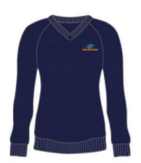
Jumper embroidered with same crest for all year groups