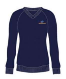
Jumper embroidered with same crest for all year groups